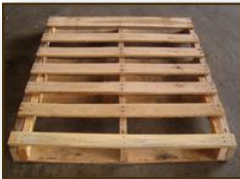
TYPICAL GMA PALLET

Most companies utilize GMA pallets and or slip sheets to transport their finished products from production lines to a distribution center for storage. These GMA Pallets are manufactured by hundreds of companies out of all types of wood resulting in a short life cycle and poor quality. If a supplier utilizes slip sheets for product transportation it will need to be placed onto a GMA pallet at the distribution center for storage in rack structure.