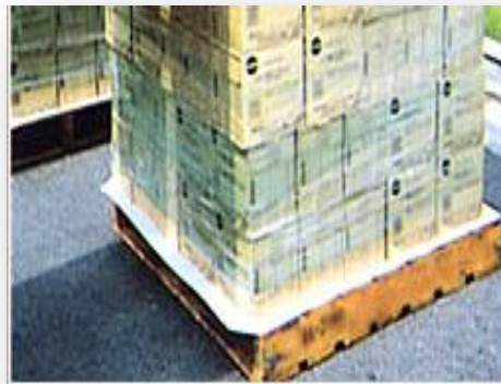
GMA PALLET WITH SLIP SHEET

Slip sheets are usually comprised of a thin, durable material and are designed to extend outside the standard load envelope on two sides of the pallet so that the slip sheet attachment device can grab the slip sheet. The extension is typically about 4 inches, however, it is common to see the slip sheet extending out as much as 8-10". The extended slip sheet has the potential to cause two very expensive problems in the ASRS system. 1. The system must be designed to handle the overage resulting in a lower cube density. For a large system, this can amount to millions of dollars in additional rack and building costs and 2. Slip sheets that extend past the design limits can cause load profile errors in the ASRS that cost labor dollars to fix.